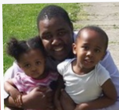
GOING HOME TO KENYA!