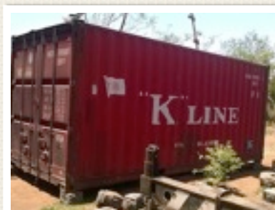
THE CONTAINER ARRIVES