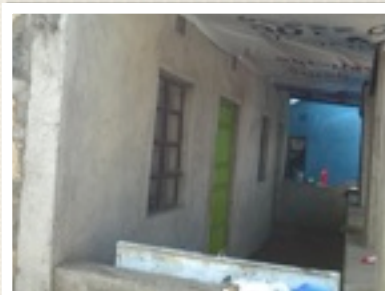
JOSEPH'S NEW HOME