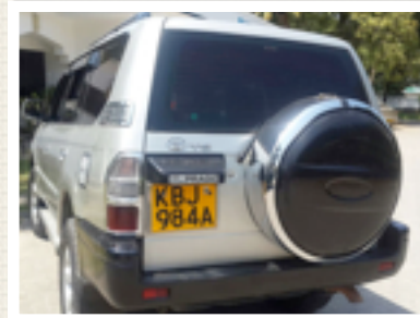
A CAR FOR THE MINISTRY