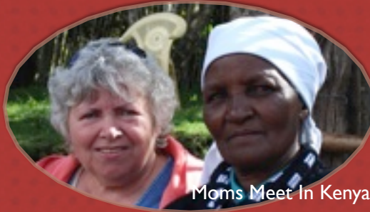
Moms Meet In Kenya