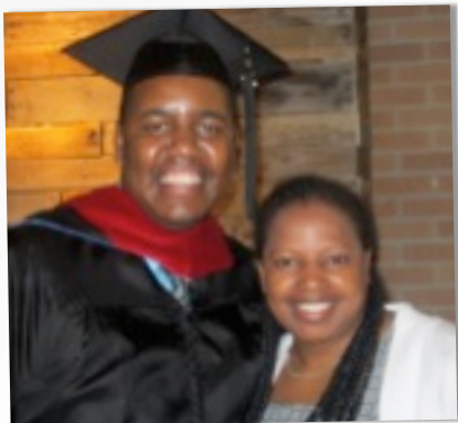
GRADUATE OF MOODY THEOLOGICAL SEMINARY

How exciting, the next day as the plane landed in Kenya, to know they were home again, ready to begin the work God had called them to.