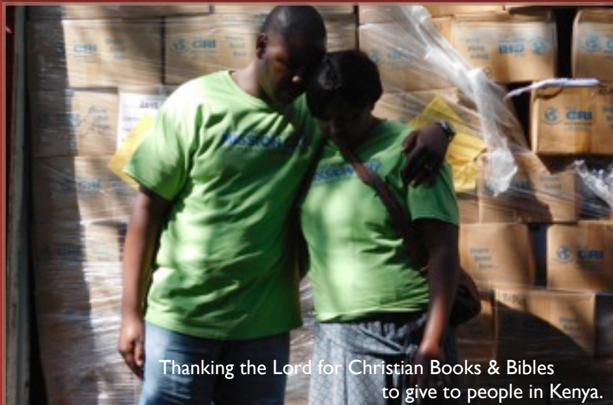
Thanking the Lord for Christian Books & Bibles to give to people in Kenya.