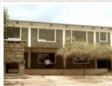
OUR NEW WOT CENTER IN MAAI - MAHIU