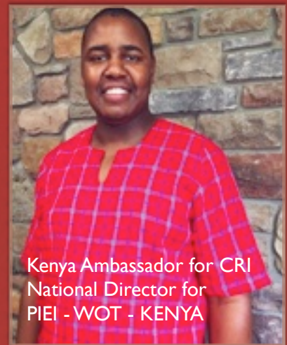
Kenya Ambassador for CRI National Director for PIEI - WOT - KENYA

After my graduation on May 2 nd 2015, it was clear to me that it was time to get back to Kenya. Arriving in Kenya in August, we did not know what to expect but we knew that God had called us to serve His purpose in Kenya and indeed Africa.