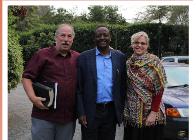
FIRST U.S. TEACHERS