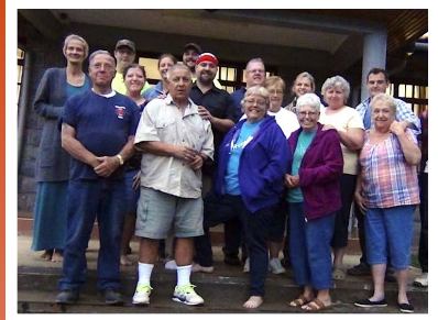
FIRST MISSION TEAM