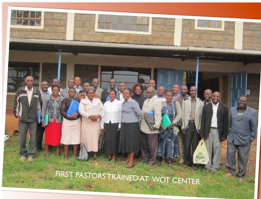
FIRST PASTORS TRAINED AT WOT CENTER

2015/16 . . . A YEAR OF MANY FIRSTS FOR THE WORD OF TRUTH CHRISTIAN RESOURCE AND TRAINING CENTER