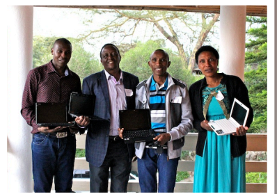
FIRST NATIONAL COMMITTEE