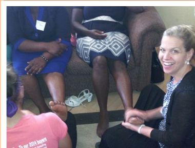
LADIES FOOT MESSAGES