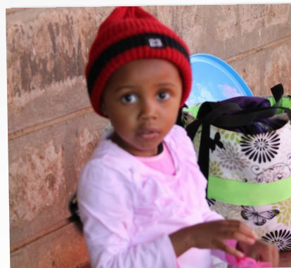
GRACIE HELPS AT THE CENTER TOO!